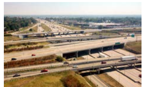
Aerial photo showing Watterson Expressway at I-65

points are limited to what the mobile unit can view. For example, locations behind a median barrier wall will not be viewable on a first pass; therefore, a second pass in the opposite direction may be required to get a complete set of data points for that roadway.